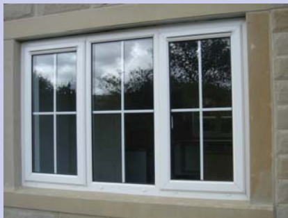
A window installed by Castlebrook Developments Ltd