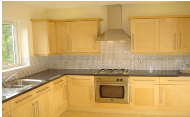
A kitchen installed by Castlebrook Developments Ltd

Castlebrook Developments can also undertake any