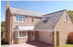
A house built by Castlebrook Developments Ltd

If you are looking for a brand new home or an extension / alteration built with pride and superior attention to detail by trained craftsmen, take a closer look at Castlebrook